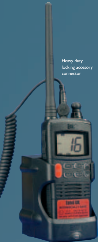
Heavy duty locking accessory connector